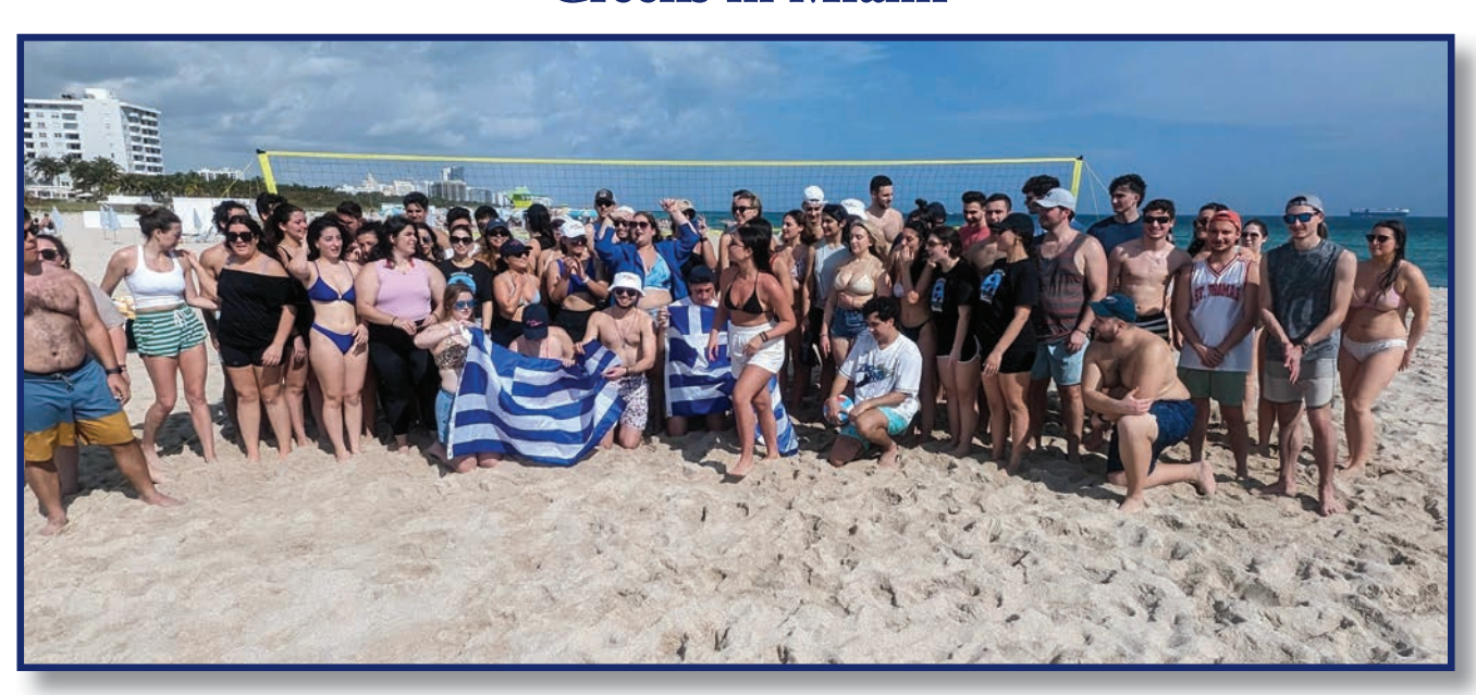
Sons and Maids end a fabulous weekend. 75 Sons and Maids participated in Greeks in Miami. 7 teams. The Charlotte Sons repeated as champions. The Region Rats were second, followed by the Cherry Hill Sons and Maids.