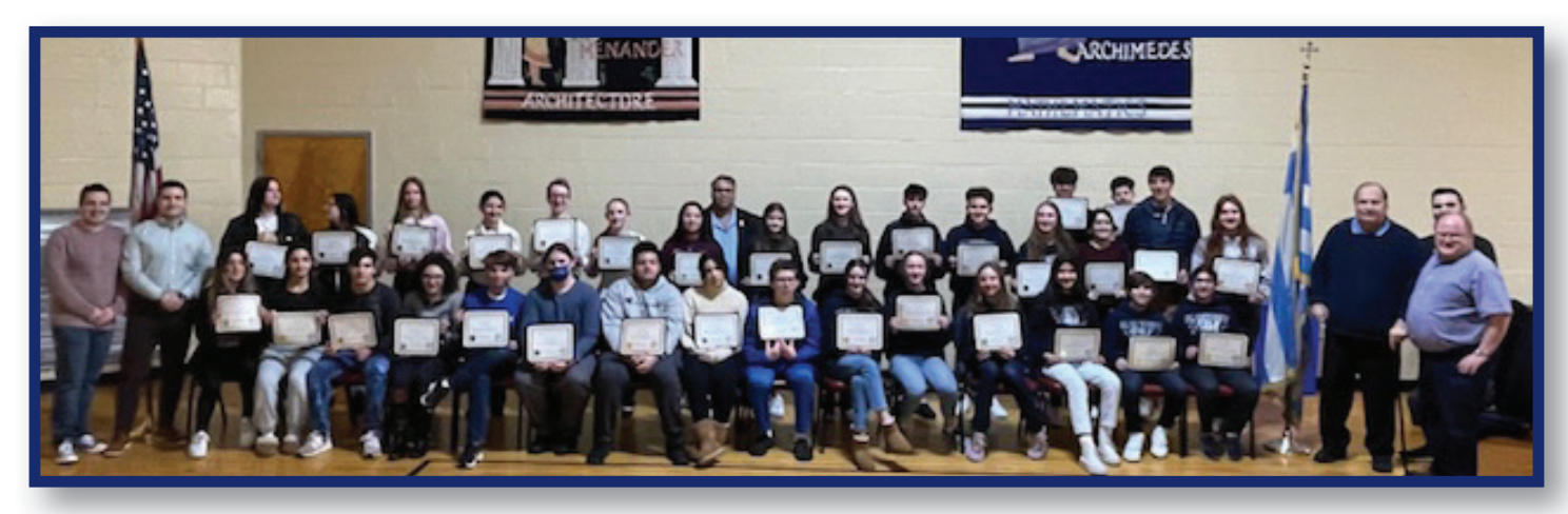
Congratulations to all participants at our annual Hellenic History Tournaments! 9 teams across multiple chapters participated this year. The tournament was held on Saturday February 17th. A wonderful turnout!